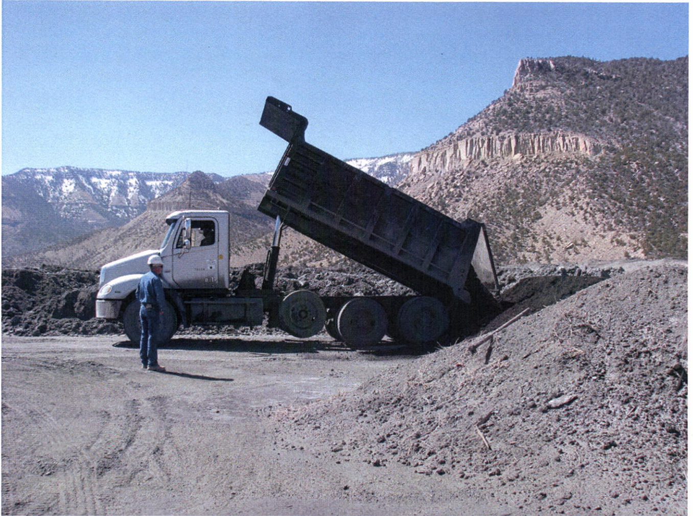
Looking south at the waste being dumped at the working face