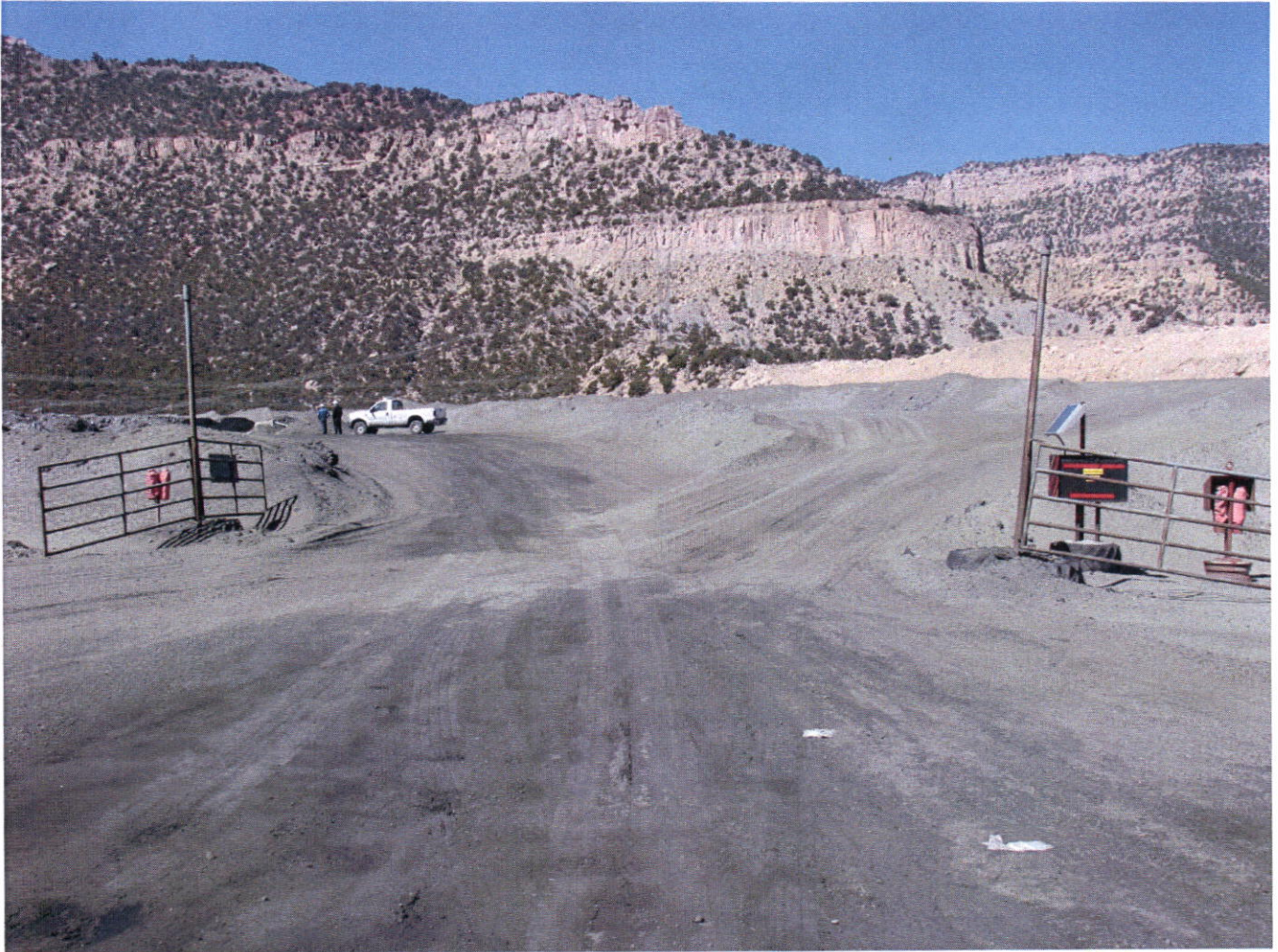
Entrance to the landfill